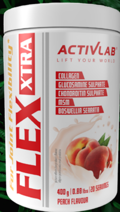
Package: 400 g