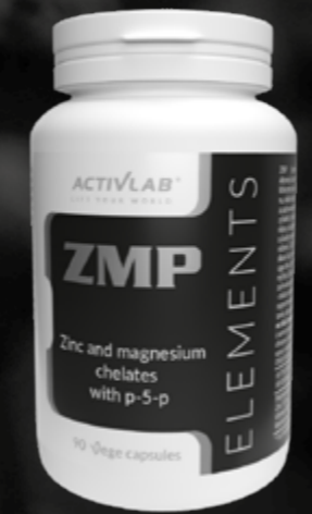
Package: 90 vege capsules