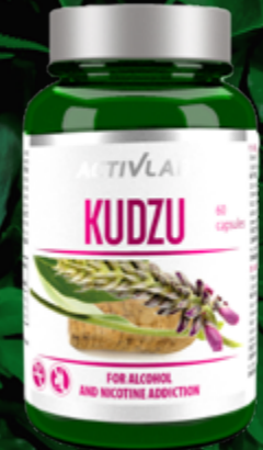
Package: 60 capsules