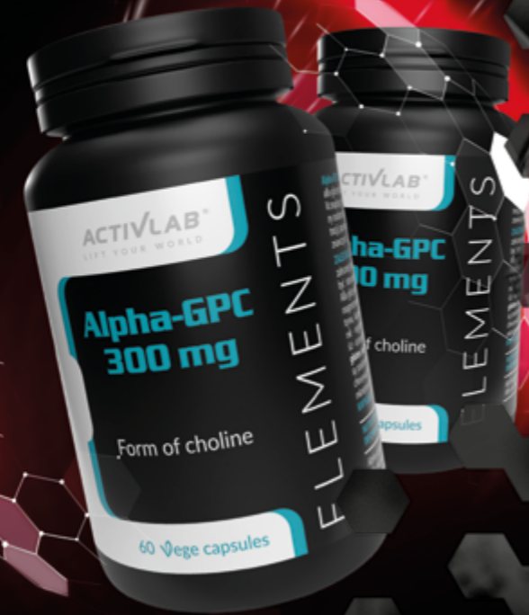
Package: 60 vege capsules

EFFECTIVE SUPPORT FOR COGNITIVE PROCESSES SCIENTIFICALLY PROVEN VEGAN FRIENDLY