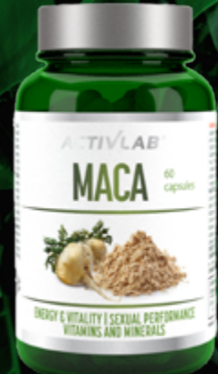
Package: 60 capsules