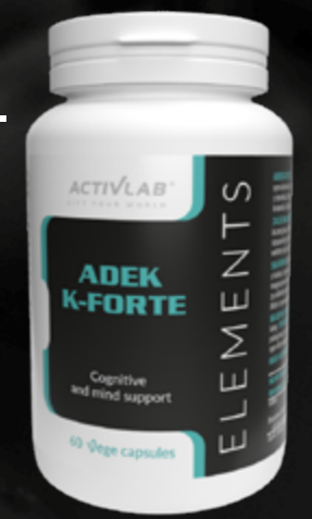
Package: 60 vege capsules

The full composition is available at www.activlab.pl