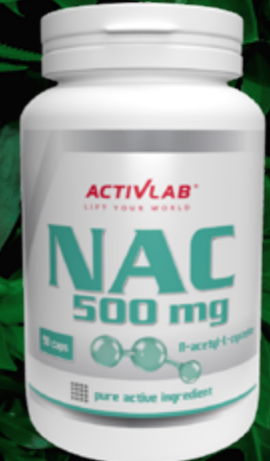
Package: 90 capsules